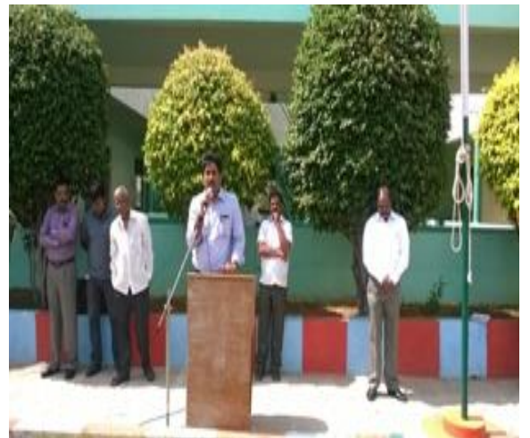
HOD of ECE Dept addressing the gadering on the occasion of 15 th AUG.