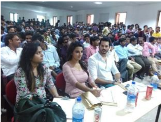
Photos of event with guest and participants