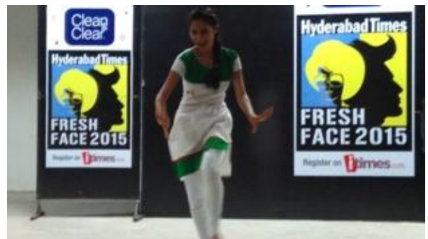
Photos of event with participants